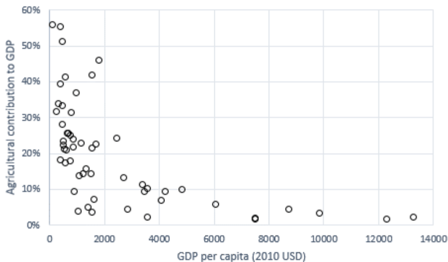
Figure 1: Agricultural GDP in African countries at different levels of income in 2016. Calculated by author using FAOSTAT data

Agriculture is a mainstay of the African economy. Although officially, agricultural production directly accounts for about only 15 percent of GDP in the region (FAO Statistics Division, 2019), this figure understates the importance of agriculture in most countries. As shown in the figure below, countries with high GDP tend to have a lower share of agriculture in their economies. Thus, agriculture is more important in countries with higher poverty rates. Continentally, agriculture is a major source of employment for 70% of the population, and accounts for more than half of total employment (OECD/FAO, 2016). Agriculture is also an important part of regional trade, accounting for 10% of regional exports, although this share has been decreasing in recent decades (Badiane, Odjo, and Collins, 2018).